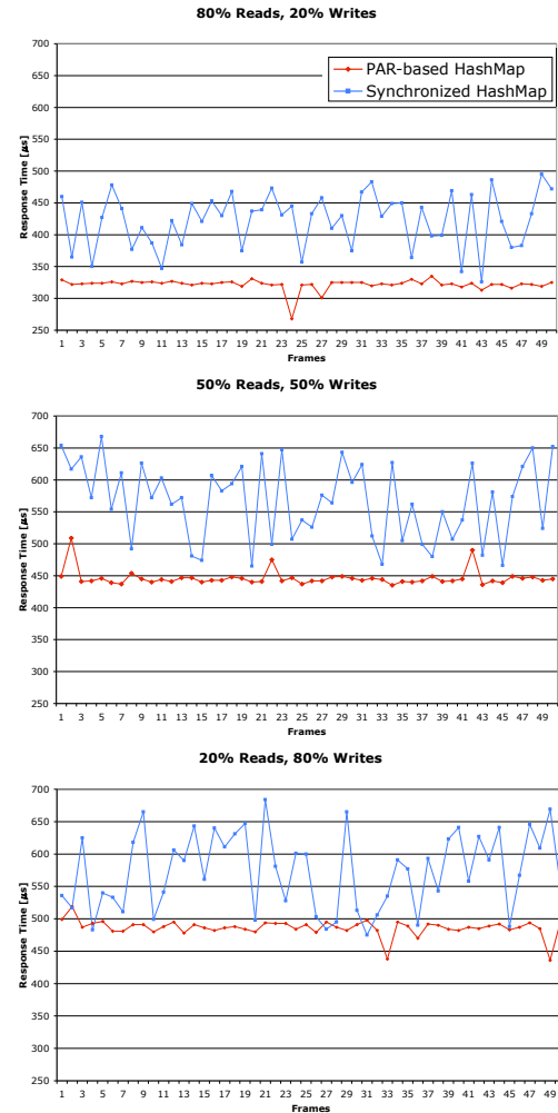
Figure 4. Response time of a high-priority thread in the HashMap Microbenchmark. The x-axis indicates the number of periods that have elapsed (frames), and the y-axis indicates the response time of the high-priority thread (in microseconds). Lower is better. The graph compares RTSJ locks with PARs, and indicates that using PARs provides consistently better performance.

PRISMj is a Real-time Java application developed in a collaboration between the Boeing Company and Purdue University. PRISMj is designed to run on a ScanEagle Unmanned Aerial Vehicle (UAV), a low-cost, high-endurance UAV developed by Boeing and the Insitu Group. PRISMj controls components of the UAV dedicated to the Global Positioning System, the airframe, tactical steering, and navigation steering. It runs over 100 threads in three rate groups (20Hz, 5Hz, and 1Hz). These threads perform different tasks. There is a single infrastructure thread which acts as a cyclic executive and pushes events to components in the physical device layer. Based on those events, 5Hz and 20Hz threads implement steering and route computation. The 1 Hz thread simulates the pilot control component and periodically switches all components in the system between tactical a navigation steering. The source code for PRISMj represents approximately 110 KLoc; this number does not include libraries.